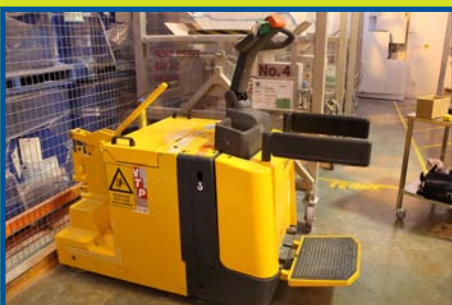
"Jungheinrich" Tank Transporter, Model ERZ265, 6500kg capacity