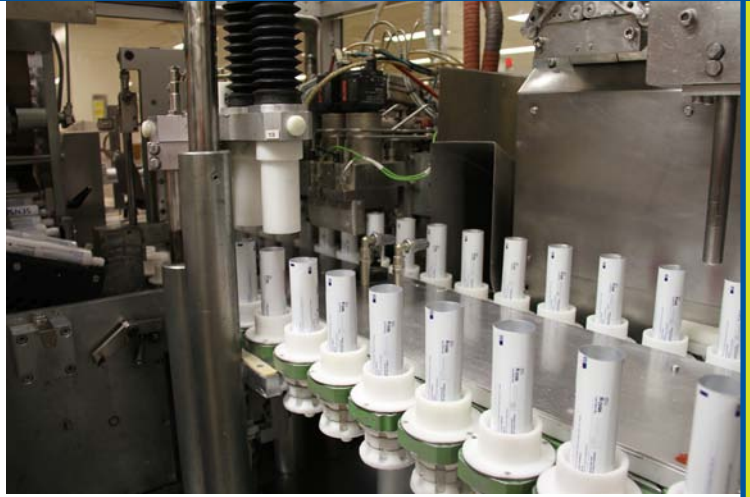
“Nordenmatic” Tube Filler, Model 2002, unit is setup with twin automatic tube loaders, 2 head fill, suitable for 3 different products/colours in one tube, Hot air sealing, full controls