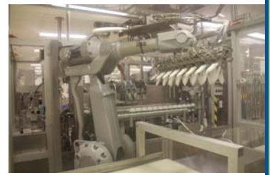
“Nordenmatic”, Tube Filler, Model 2002, complete with ABB Robot Model IRB 2400 M98 tube loader, 2 filling heads, suitable for 3 products/colours in the one tube, hot air sealing with leak detection system, Year 2002