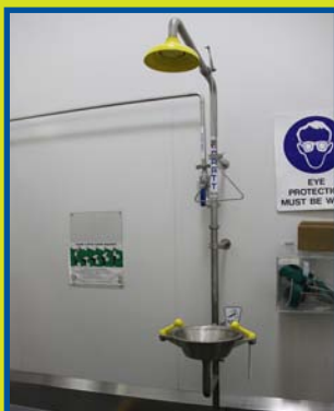
2 x "Pratt", Safety Shower & eyewash stations