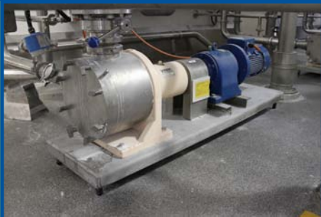
8 x "Maso" Sine Pumps, Type SPS-4", 3kw 3 phase 72rpm