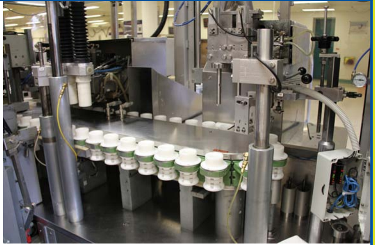
“Nordenmatic”, Tube Filler, Model 2002, unit is setup with automatic tube loader, 2 head fill, speed of 200 tubes per minute, control panel, high frequency sealing head with controller.