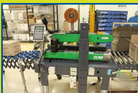
“Cling”, Carton Taper, Model XL35 complete with inkjet Printer