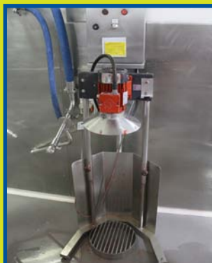
2 x Ystral 1.1kw variable speed Mixers