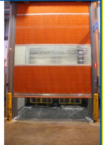
Bag unloading room, complete with 2 x "Flexicon", Bulk Bag Unloaders, each setup in a mild steel frame with electric hoist and trolley. Units complete with power cincher, bag activators, s/s hopper with agitator and vibrator. Safe working load of 1500kg, also included 2 x "Wilden" M8 Diaphragm Pumps, "DCE Vokes", dust collector and Rapid Roller Door