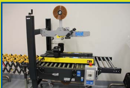
"Siat" Carton Taper, Model S8/4-S, Top and Bottom Taper