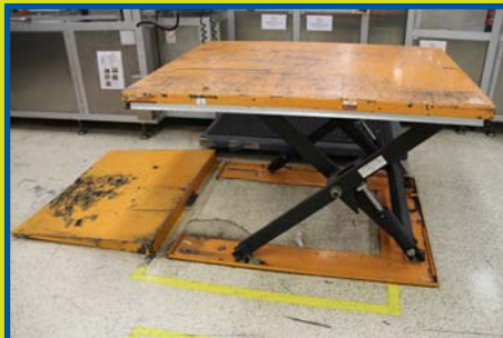
3 x Low Profile Lift Tables, Model Hy1001, 1000kg max capacity