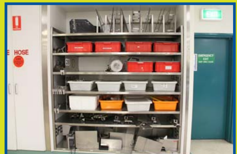
Large quantity of format and spare parts to suit lines 1, 2 and 3