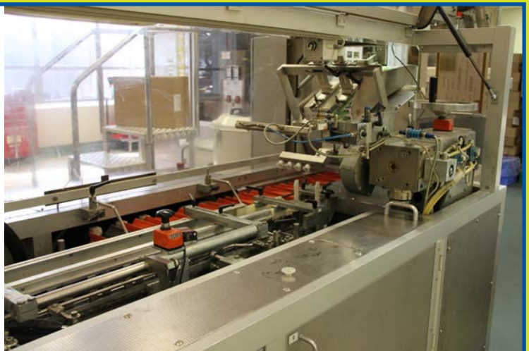
“Nordenpac”, Cartoner, “ Model 2002, unit is setup with fully automatic infeed conveyor, automatic carton erector, Nordson Hot Gluing unit, fully guarded, fully adjustable, full control panel, rejection station, and complete with transfer conveyor