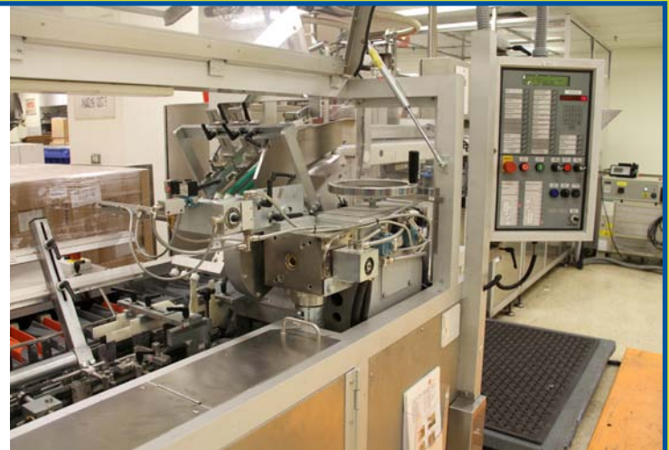
“Nordenpac” Cartoner, Model 2002, setup with infeed conveyor with push type transfer, automatic carton loading machine / erection station, Nordson Vista Gluing system, fully guarded, fully adjustable and automatic, full controls