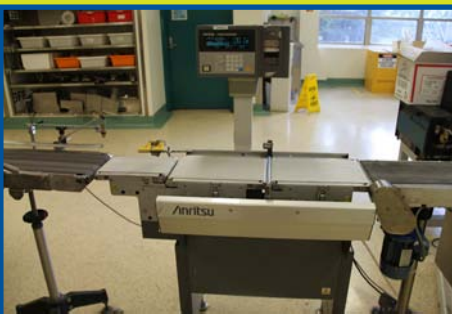
“Anritsu”, Checkweigher, Model KW534A, 10gm to 1200gm capacity, 220 pieces per minute.