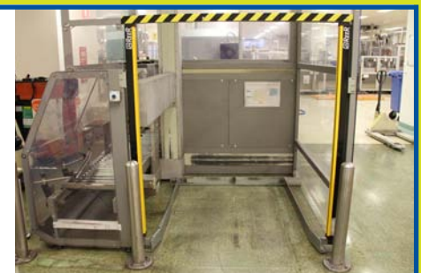
“Marchesini” Case Packer and Palletiser, Model MCP840, Year 2000, setup for tape sealing and complete with a HSAjet inkjet printer fully guarded and full controls.