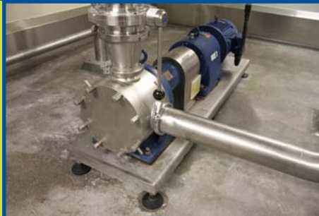
3 x "Maso" Sine Pumps, Type SPS-4", 9.2kw 3 phase 99rpm