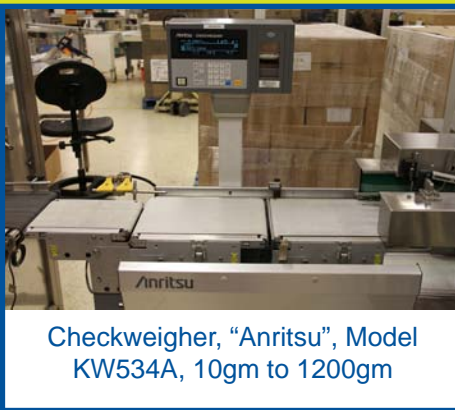
Checkweigher, “Anritsu”, Model KW534A, 10gm to 1200gm