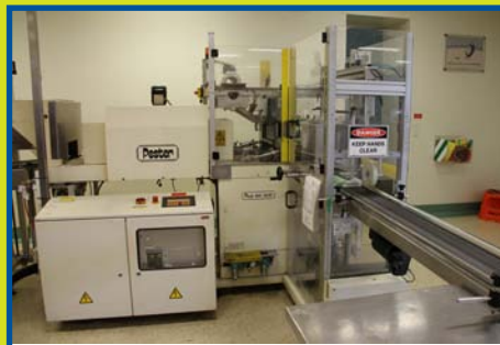
“Pester” Heat Shrink Tunnel and Collator, 200mm wide x 3300mm long infeed conveyor, Pewo Pack 450 SN stacking type collator and sleeve wrapper, Pester Heat Shrink Tunnel