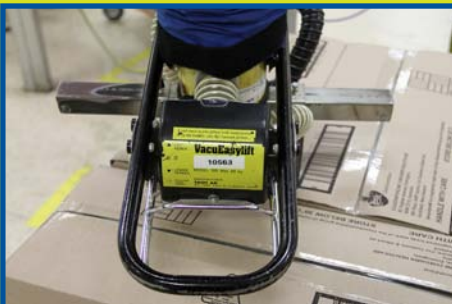
2 x VacuEasyLift, Vacuum Bag Lifter, Model 120, Max capacity 40kg, 6mtr overhead gantry