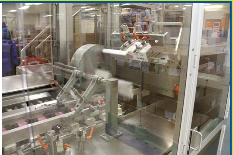
“Nordenpac” Cartoner, Model 2002, setup with infeed conveyor with push type transfer, automatic carton loading machine / erection station, Nordson Vista Gluing system, fully guarded, fully adjustable and automatic, full controls