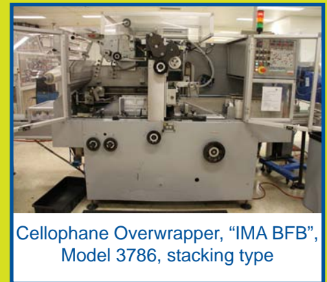
Cellophane Overwrapper, “IMA BFB”, Model 3786, stacking type