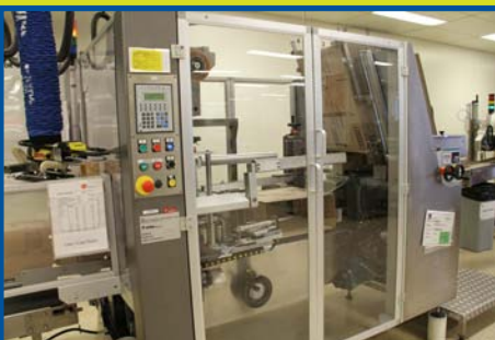
“IMA” “BFB”, Case Packer, Model CP18BA, infeed conveyor, automatic case feed, complete with setup for tape sealing 2004 model