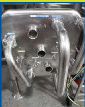
Various stainless steel Key Stations