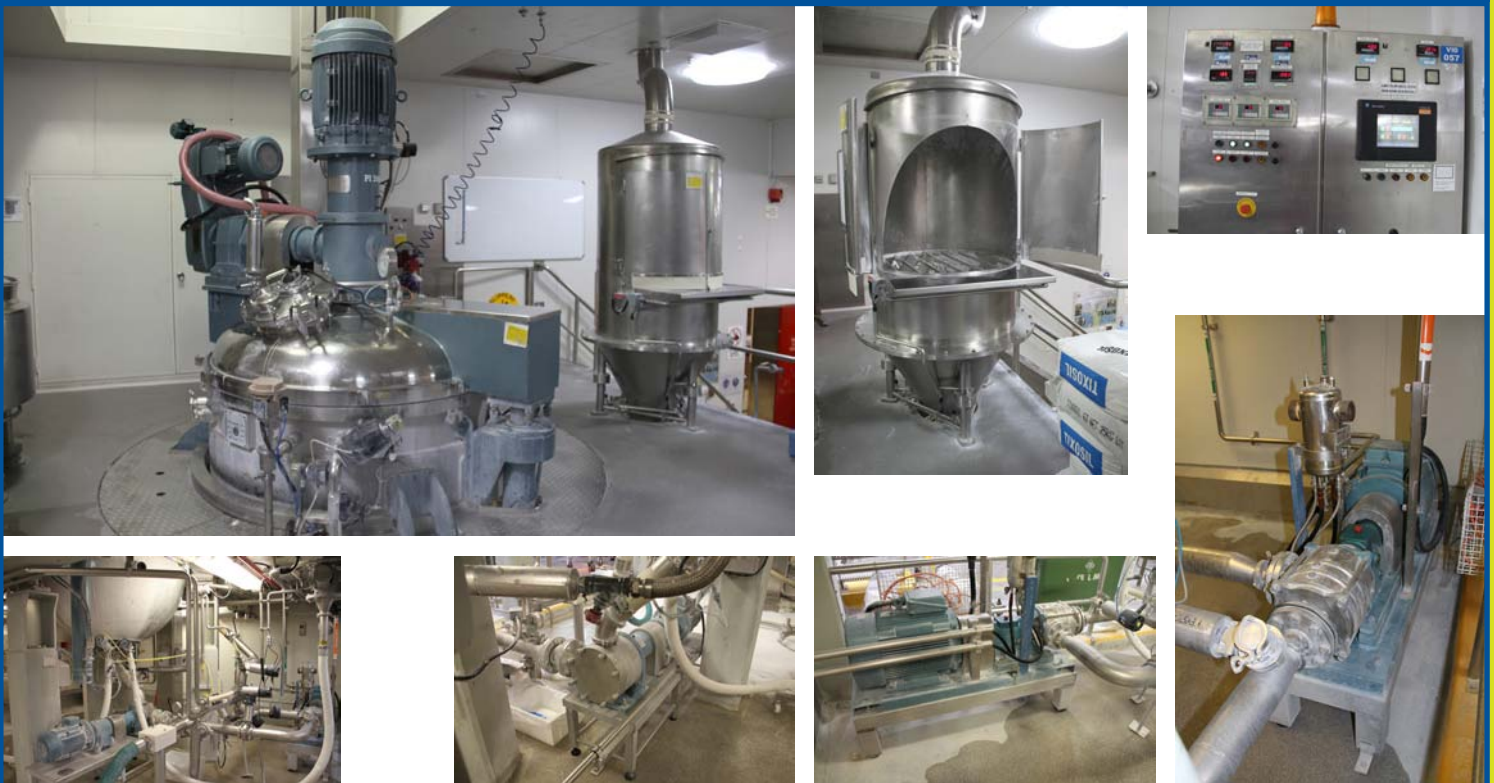
Stainless Steel Steam Jacketed Vacuum Mixing Vessel with Hydraulic Lift out Contra Rotating variable speed scrape surface mixer and 2 speed in-tank emulsifier complete with Vacuum powder dump hopper, control panel, 7.5kw, 220 rpm Sine Pump, additional external 37kW IKA Dispax reactor emulsifier, hydraulic power pack, vacuum pump including interceptor filter.

Contact: Fallsdell Machinery for a comprehensive list and to arrange an on-site inspection. PLEASE NOTE: ALL INSPECTIONS BY APPOINTMENT ONLY