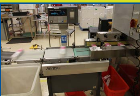
“Anritsu” Check weigher, Model KW534A, 10gm to 1200mg.