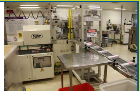
“Pester” Heat Shrink Tunnel and Collator, 200mm wide x 2100mm long infeed conveyor, Pewo Pack 450 SN stacking type collator and sleeve wrapper, 420mm wide Pester Heat Shrink Tunnel, gravity out-feed conveyor.