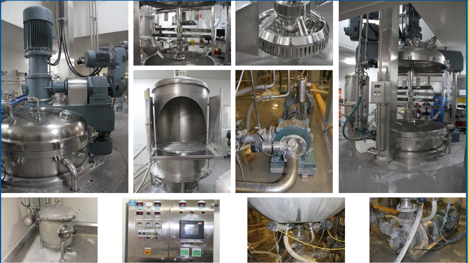
Stainless Steel Steam Jacketed Vacuum Mixing Vessel with Hydraulic Lift out Contra Rotating variable speed scrape surface mixer and 2 speed in-tank emulsifier complete with Vacuum powder dump hopper, control panel, 30kw 259 pm Sine Pump, additional external 37kw Ultra Turrax Inline Emulsifier, hydraulic power pack, 3 x vacuum pumps including interceptor filter.