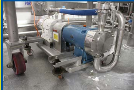
4 x "SSP" Lobe Pumps, Model SR-5-116-HD/3A, 3kw, 65rpm, 63mm dia