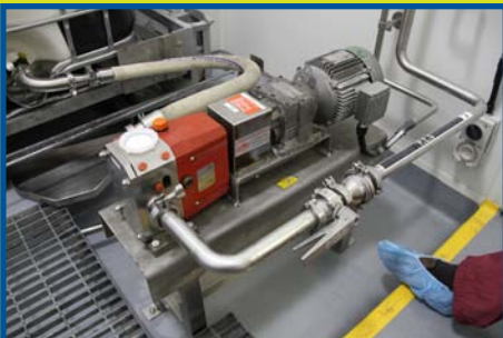
2 x "Johnson" Lobe Pumps, Model 2/0017, 1kw, 328rpm 30mm dia