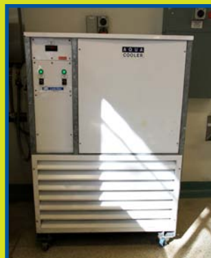
Chiller, "Aqua Cooler", Model C400A, 4hp unit

All care has been taken to ensure the description and photographs in this brochure and on our website are correct, however the description and photographs should be used as a guide only and your inspection of the equipment is recommended