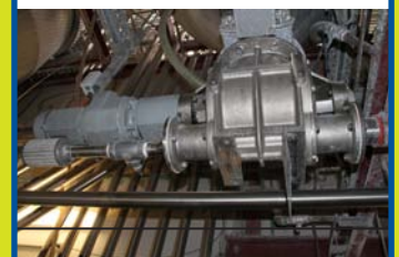
Bag unloading room, complete with "Flexicon" Bulk Bag Unloader, mild steel frame with electric hoist and trolley, power cincher, bag activator, S/S hopper with vibrator, deflator, S/S rotary valve. SWL 1500kg, also included roots type blower DCE Vokes dust collector and Rapid Roller Door