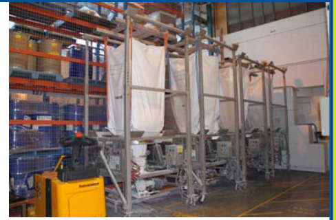
"Flexicon", Bulk Bag Unloader, setup in a stainless steel adjustable mobile frame for forklift loading of bulk bags. Unit complete with power cincher, bag activators and stainless steel rotary valve suitable for vacuum transfer. Safe working load of 1500kg, 2 available