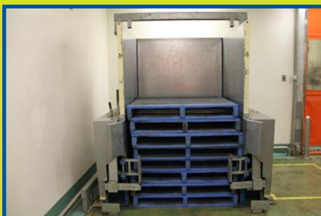
"LSK Industries" "Pallet De-Stacker, Model PD25, approx 14 pallets