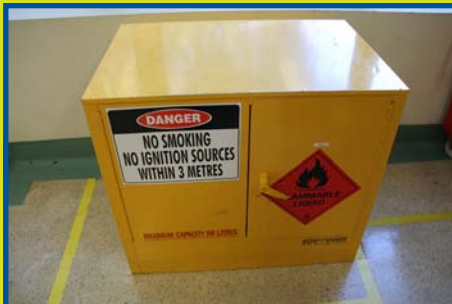
"Safe-T-Store" Flammable Goods Cabinet, 100 Ltr capacity