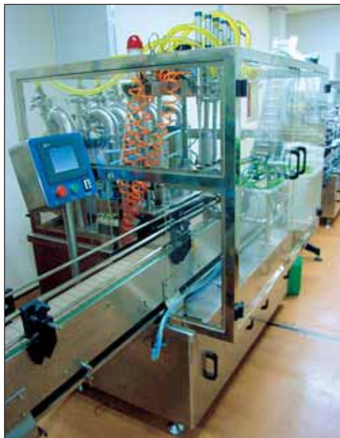
52. IN-LINE PISTON FILLER

2 Head unit, setup with stainless steel, 750ml pistons, variable speed and fully adjustable. 8209