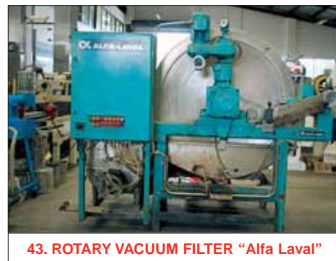
43. ROTARY VACUUM FILTER "Alfa Laval"

Model 12ZP2, DP 1000Kpa, all stainless steel, as new condition 2006. s/n IM009/12ZP2-1