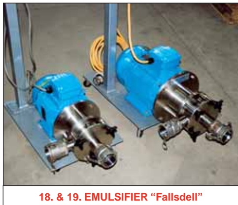
18. & 19. EMULSIFIER "Fallsdell"

50 Ltr capacity, 450mm dia x 400mm deep, hemispherical bottom with a 25mm dia centre bottom outlet, manual tilt, lid with pouring lip. 8594