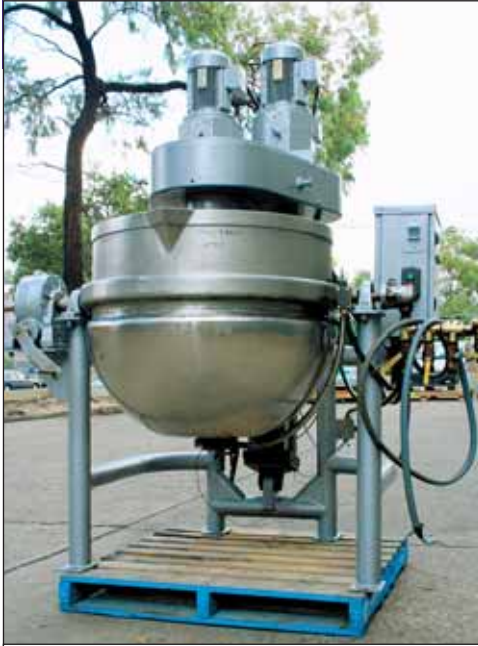
1. JACKETED MIXING PAN

ATTENTION: Chief Engineer Chief Chemist Gen Manager Buyer