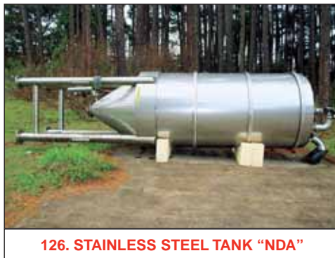
126. STAINLESS STEEL TANK "NDA"

5100 Ltr capacity, 1840mm dia x 1850mm deep, tubed legs, sloped bottom with 50mm side outlet, totally enclosed with offset manway. 2 available. 8926