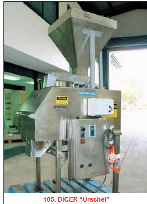
105. DICER "Urschel"

Model OV accepts products up to 69.9 mm in diameter or width, 422.3 mm diameter slicing wheel, 2.2kw motor, stainless steel, 3 phase. 8907