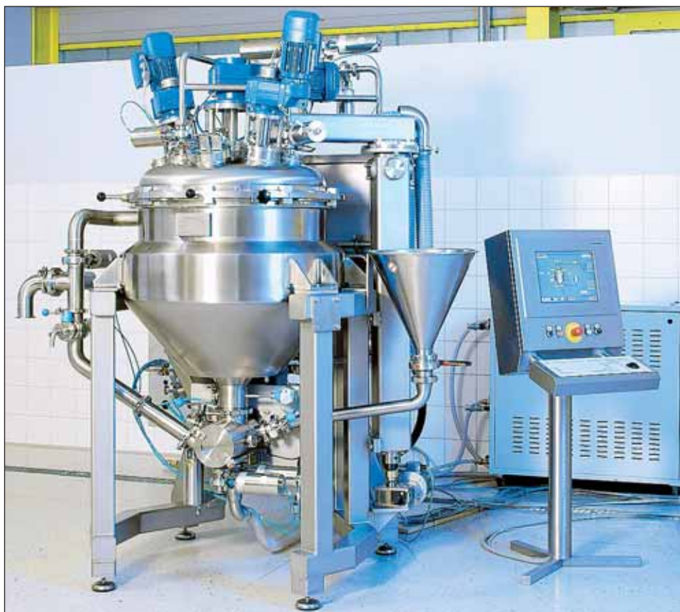
Batch Vacuum processing plant showing control panel and supply unit

Suitable for manufacture of liquid and semi liquid products in the Pharmaceutical, Food, Cosmetic, Chemical and associated industries, Zoatec processing plants stand out from all conventional systems due to their ingenious design.