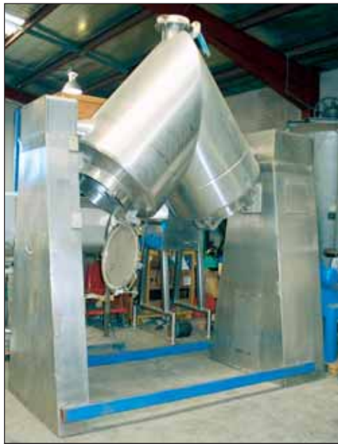
78. V BLENDER "Tanner"

Liquid capacity of approx 4 Ltr, all stainless steel. 8825