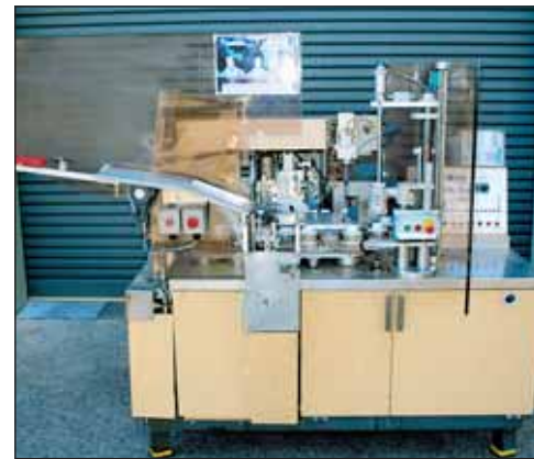
67. TUBE FILLER "Arengo"

Stainless steel, pneumatically operated, 70mm inlet. 8910