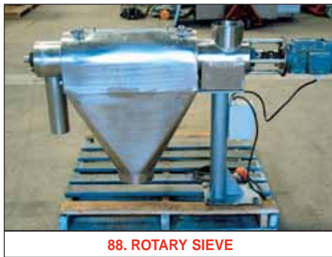
88. ROTARY SIEVE

300 Ltr capacity, 620mm wide x 720mm long x 900mm deep, stainless steel, 5.5kw motor, bombay door discharge, full controls and sieve. 8914\