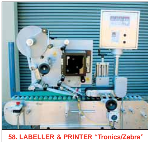
58. LABELLER & PRINTER "Tronics/Zebra"

System 2000 model, 3500mm long x 150mm wide conveyor belt, complete with "foilmark 920" heat foil printer, vacuum wrap around belt, scroll infeed, full controls, mobile. 8980