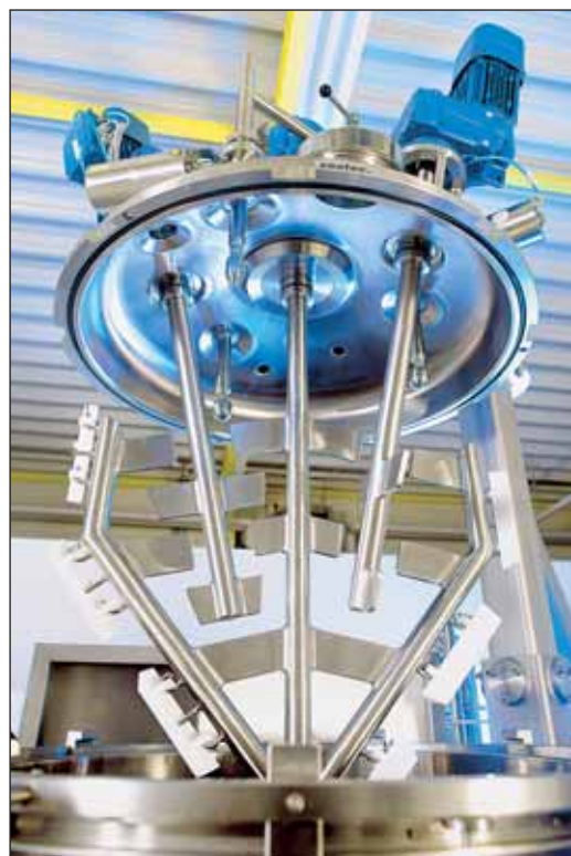
The agitating and mixing system which has a modular design makes it possible to achieve the correct mixing requirements for your products