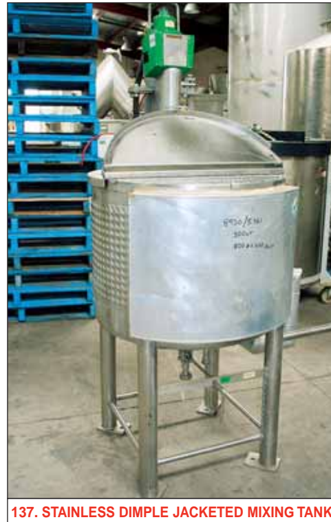
137. STAINLESS DIMPLE JACKETED MIXING TANK

300 Ltr capacity, 800mm dia x 600mm deep, dimple jacketed, hinged lid with safety grate, conical bottom with 35mm centre bottom outlet, tubed legs, air operated mixer with 1 x 135mm dia propeller. 2 available. 8930